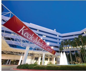
Keck Hospital of USC (KMC)