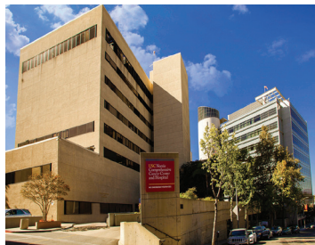
USC Norris Comprehensive Cancer Center and Hospital (NOR)