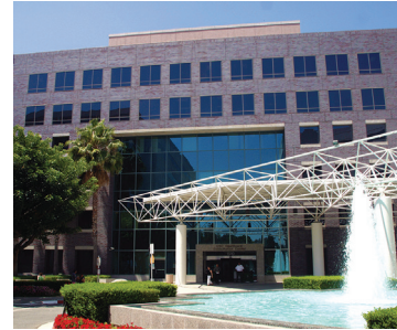
USC Healthcare Center 1 (HC1)