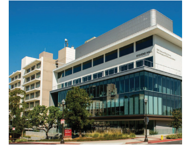
Stevens Hall (SHN)